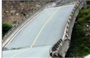
Move Forward on Transportation, Says U.S. Chamber... (/article/move-forward-on-transportation-says-us-chamber)