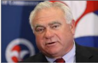
U.S. Chamber Chief Economist: Jobs Stagnated by... (/article/us-chamber-chief-economist-jobs-stagnated-by)