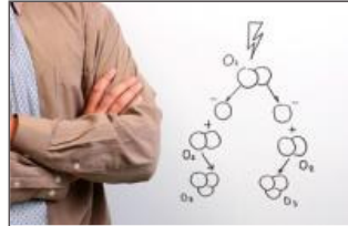
President Heeds U.S. Chamber Argument, Delays... (/article/president-heeds-us-chamber-argument-delays-ozone)