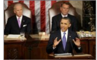
President's Jobs Plan Falls Short, Chamber... (/article/presidents-jobs-plan-falls-short-chamber-officials-say)