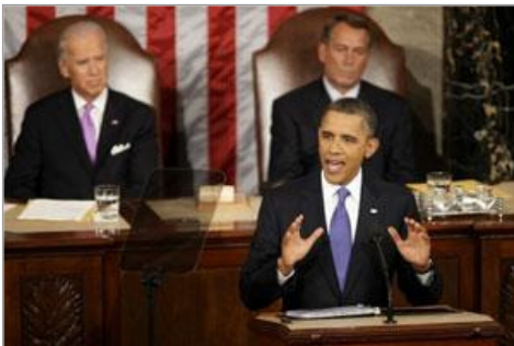
President Obama unveils a $447 billion jobs plan before a joint session of Congress.

The jobs plan that President Obama outlined to a joint session of Congress on Thursday evening falls short of what's needed to trigger more robust economic growth that will bring down the nation's stubbornly high unemployment rate, U.S. Chamber officials say.